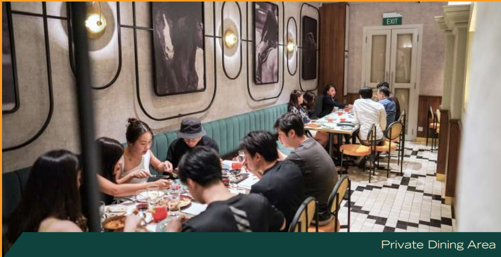
Private Dining Area