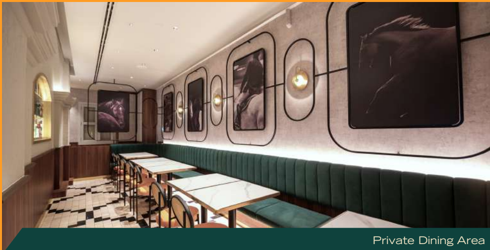
Private Dining Area