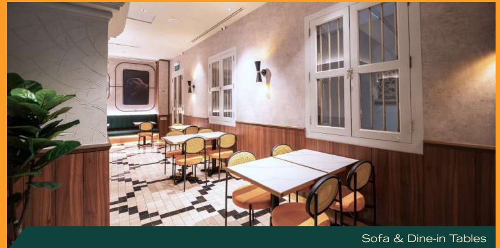
Sofa &amp; Dine-in Tables